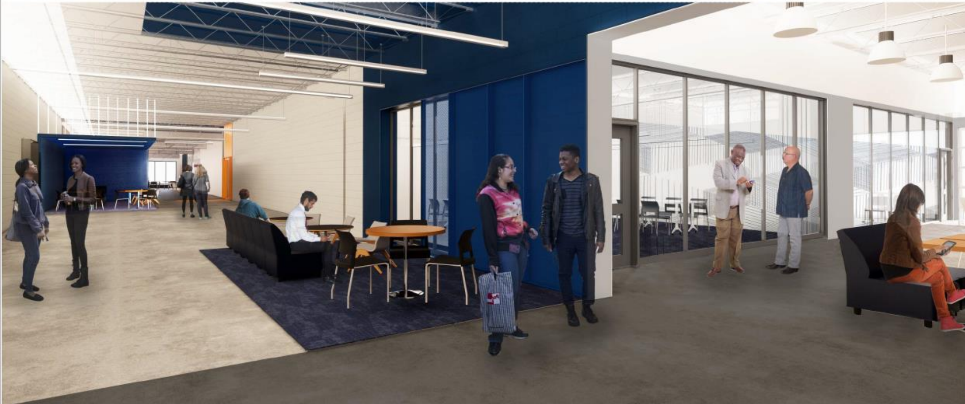
LEVEL 2: SOCIAL SPINE VIEW