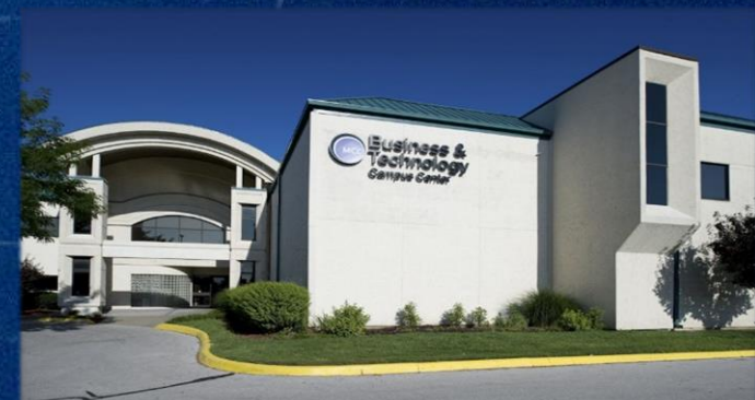
Business & Technology