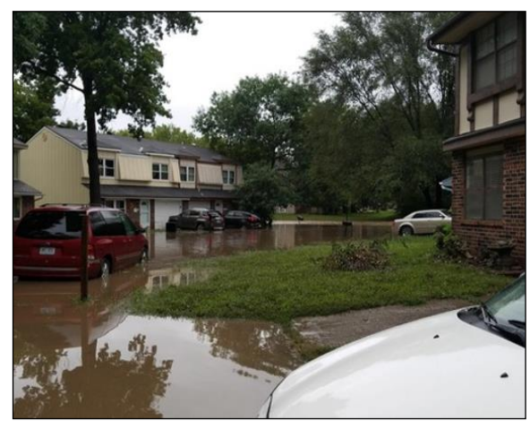
Local flooding along the Little Blue River (Grandview, Missouri)

Authority: Resolution of the Senate Committee on Environment and Public Works for the Little Blue River Basin, Missouri, 108<sup>th</sup> Congress, 2<sup>nd</sup> Session, June 23, 2004.