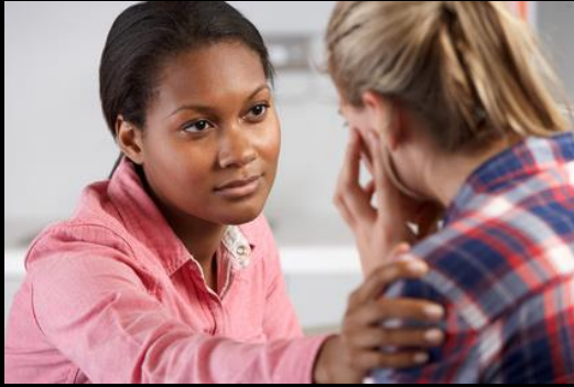
Trauma informed counseling