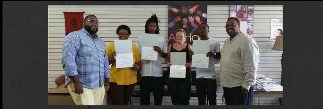
Cognitive Behavioral Intervention