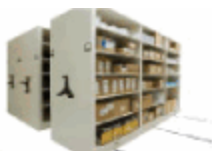
High Density Storage