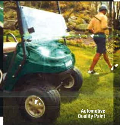
Automotive Quality Paint