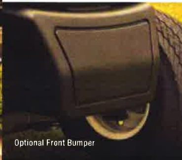
Optional Front Bumper