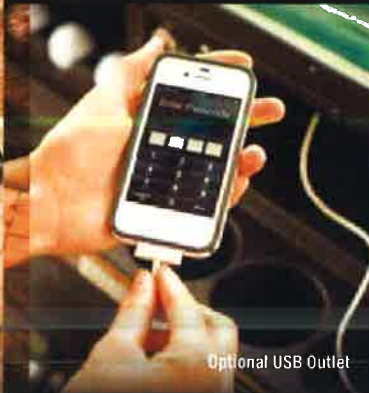
Optional USB Outlet