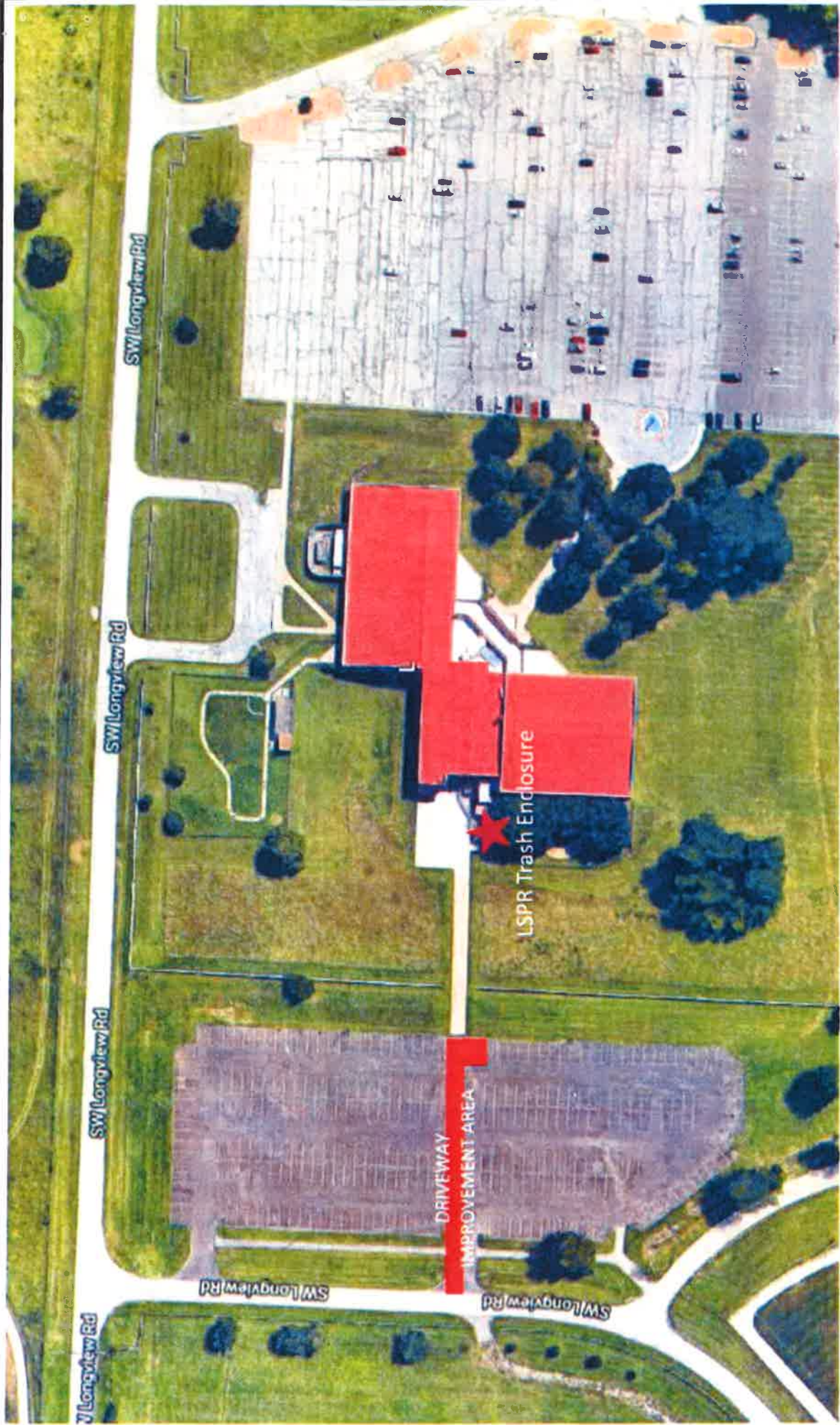
EXHIBIT "A" Intergovernmental Agreement Parking Area Entry Use and Improvement