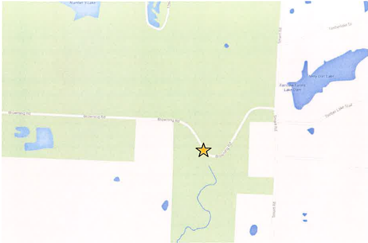
Exhibit A - Location of Project