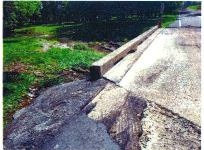
July 2019 flood damage to bridge and roadway (looking upstream from the northwest corner of the structure).