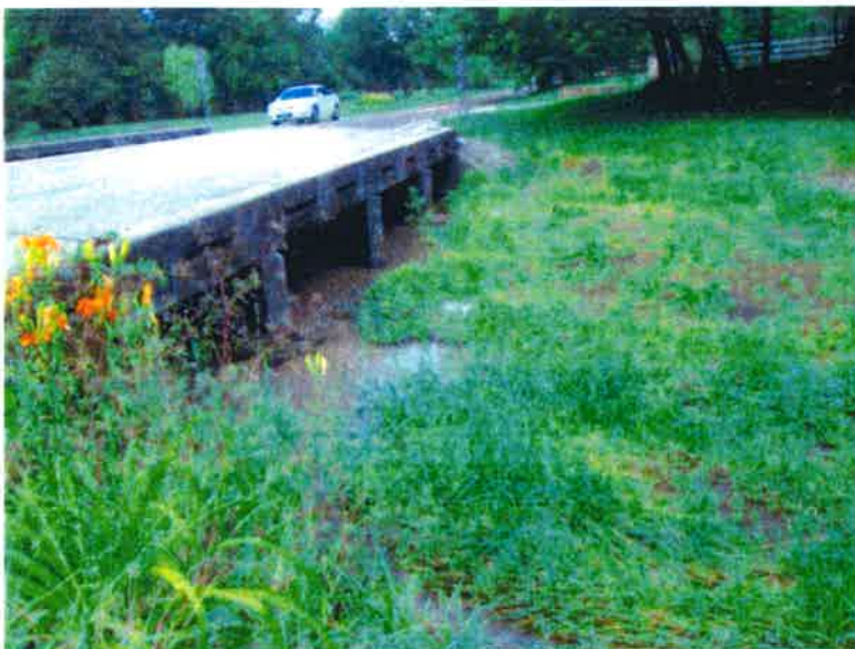
July 2017 site photo of the upstream side of the structure. Note the west bank is partially blocking the far cell from carrying full capacity flows.