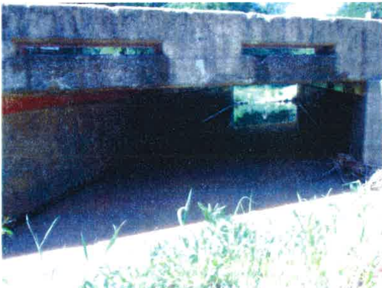
July 2017 site photo of the typical curb/railing along the bridge. The concrete is in very poor condition.