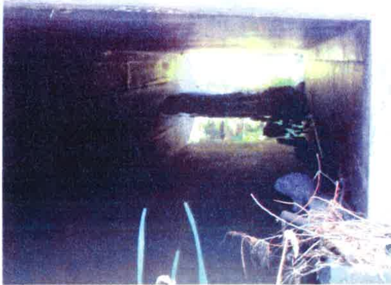
July 2017 site photo looking north inside of the 2nd barrel from east side of structure.