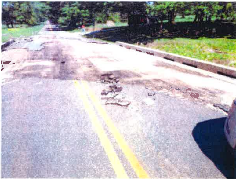
July 2019 flood damage to bridge deck (looking west from the east side of structure).