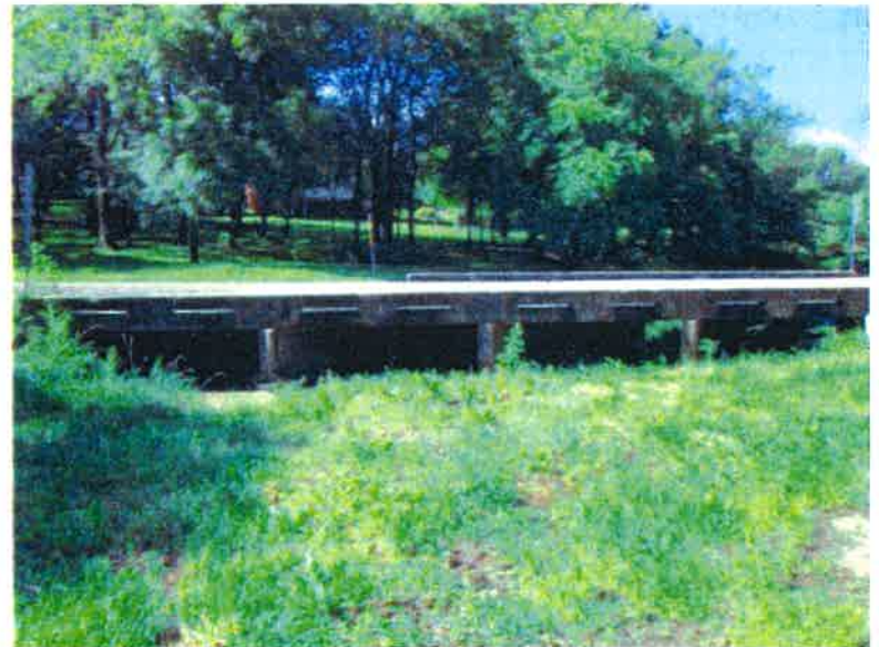
July 2017 site photo of the upstream side of the structure.