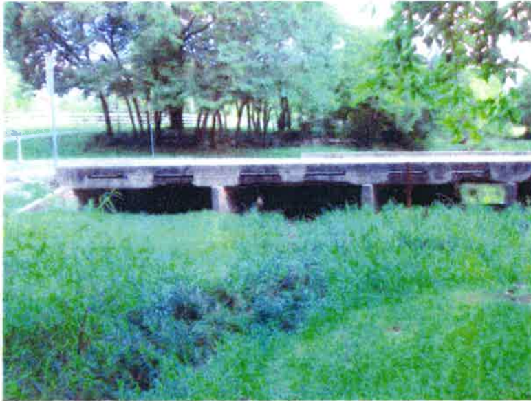
July 2017 site photo of the downstream side of the structure. Note bank on the left side of photo possibly impeding the flow through the outside cell.