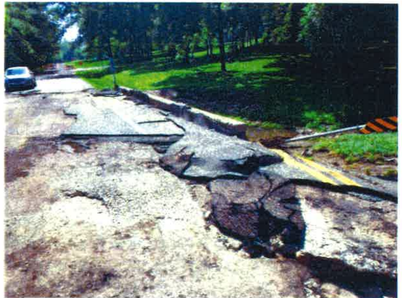
July 2019 flood damage to bridge and roadway (looking at southwest corner of structure).