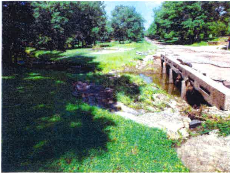
July 2019 flood damage (looking west towards downstream side of structure).