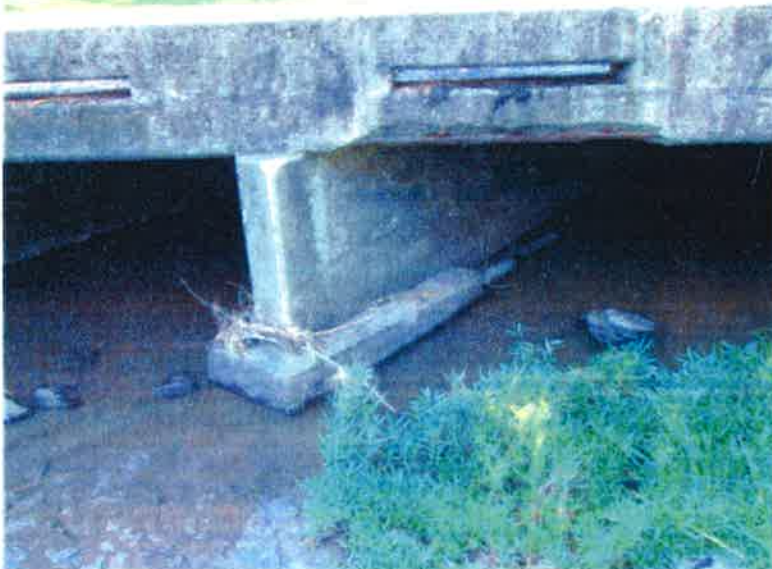
July 2017 site photo of the center piers set directly on the rock shelf in the stream. Note that footing is not keyed into the rock.