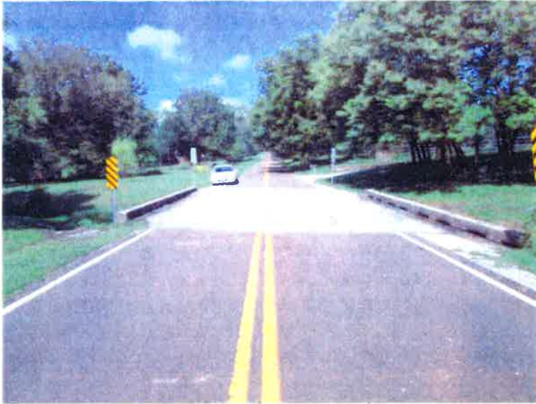
July 2017 site photo looking west across top of the structure.