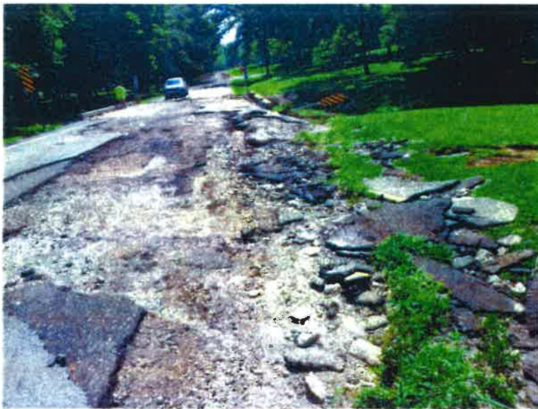
July 2019 flood damage to roadway (looking at road and ditch west of the structure).