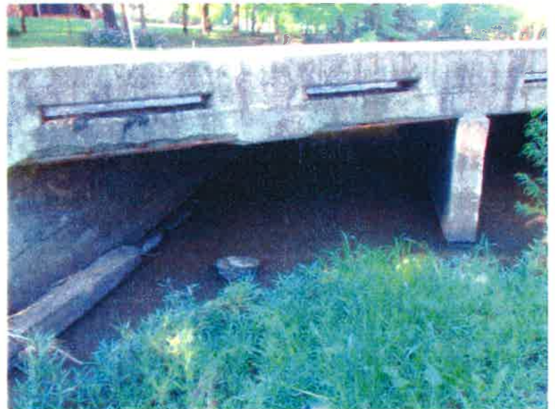
July 2017 site photo of the upstream side of the structure. Note the exposed steel at the bottom of the top slab.