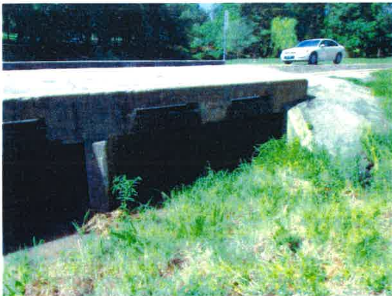
July 2017 site photo of the southeast corner of the structure. Note the paving adjacent to the RCB to prevent erosion created by runoff from the roadway surface.