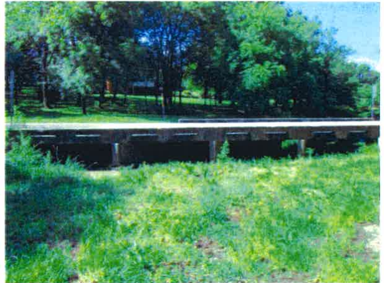
July 2017 site photo of the upstream side of the structure.