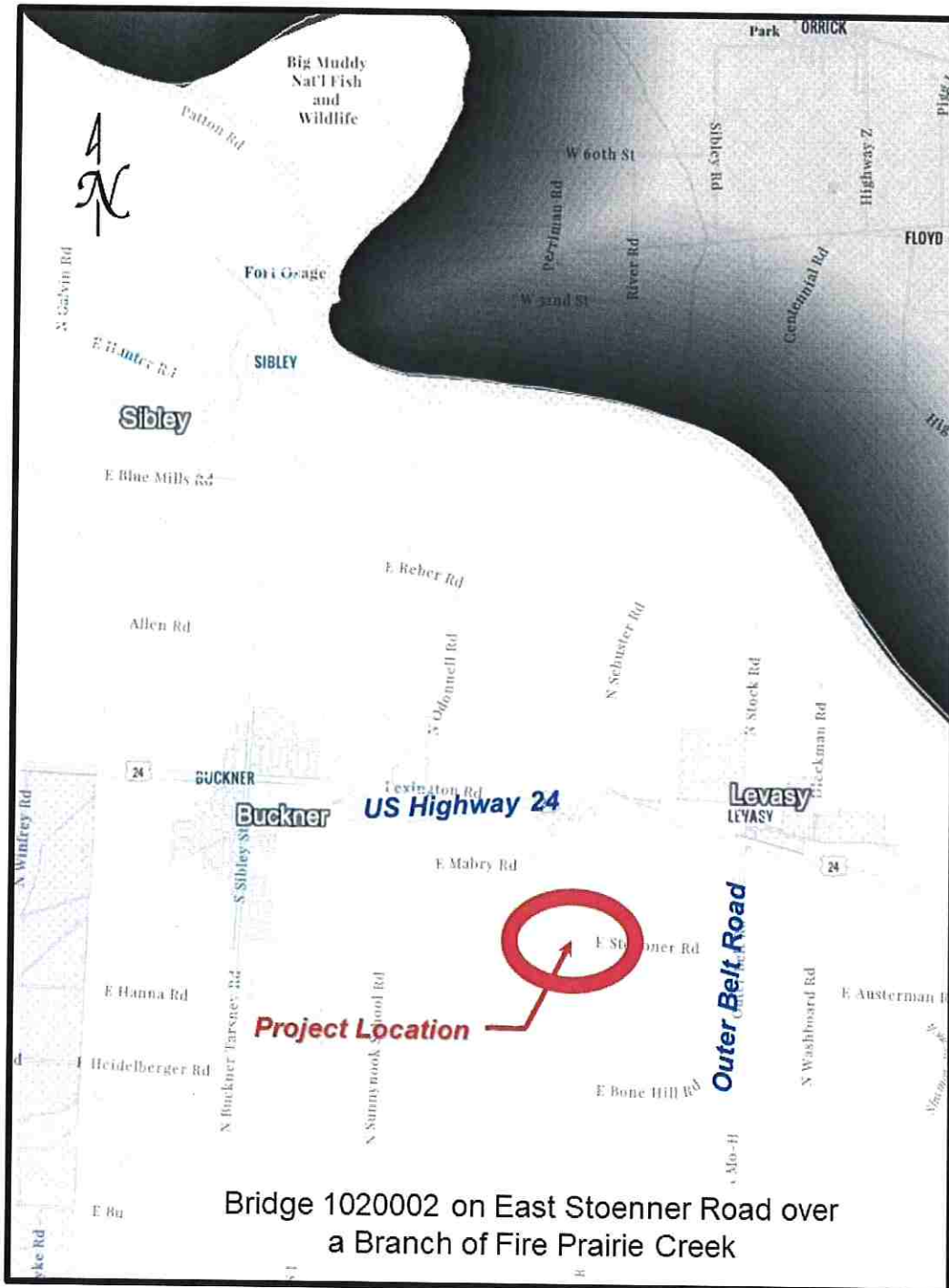
Exhibit A - Location of Project