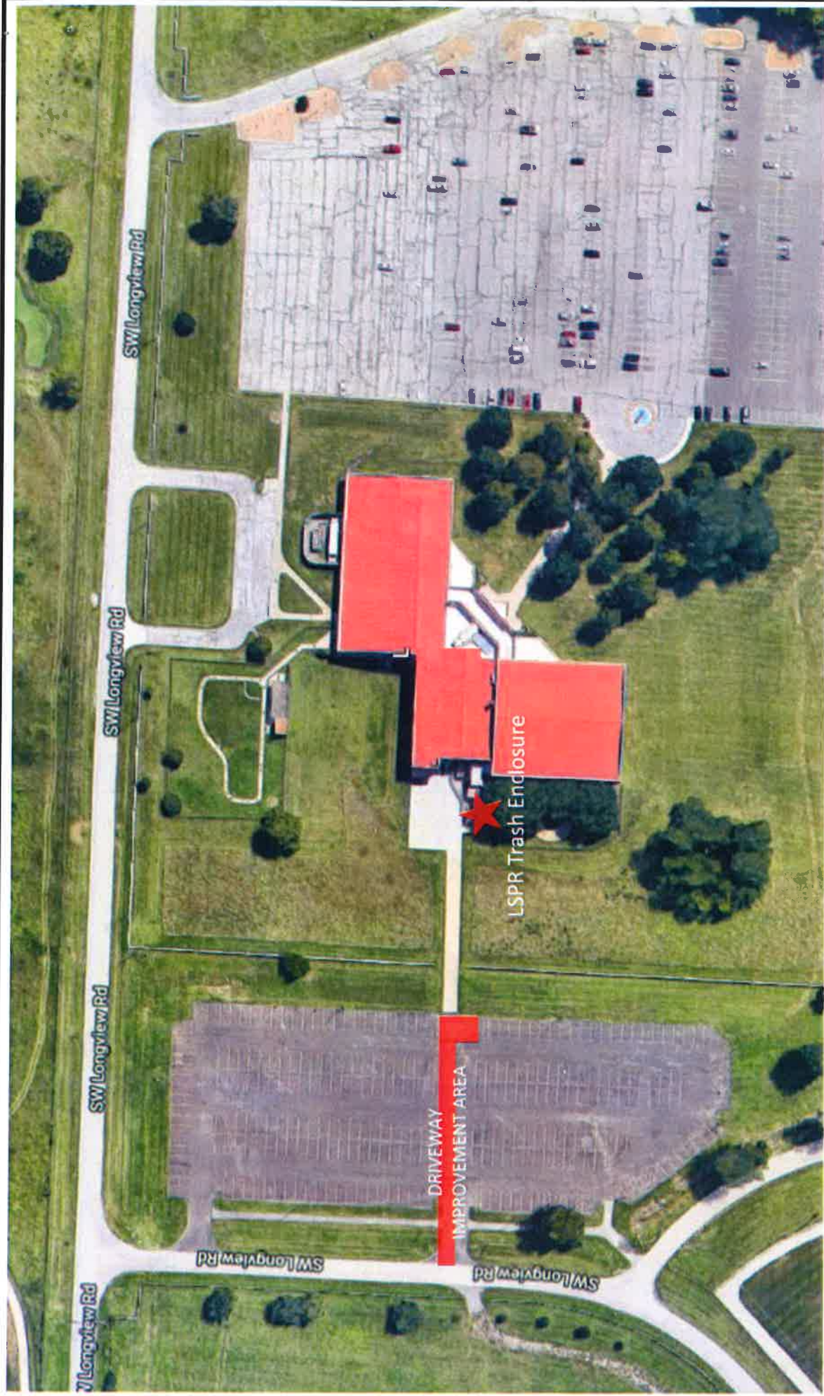
EXHIBIT "A" Intergovernmental Agreement Parking Area Entry Use and Improvement