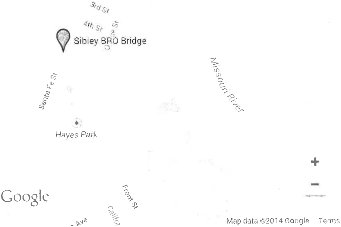
Exhibit A - Location of Project