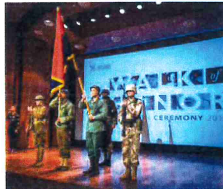
2019 Walk of Honor Brick Dedication at the Veteran Day Ceremony

Though our activities have not been finalized yet, we will have similar activities in 2020. The Veterans Day Ceremony will include an honor guard, remarks from selected local and national dignitaries, a keynote speaker, and musical performances. We will also conduct family-friendly activities during the celebration. Some of our previous activities have included a Vietnam-era helicopter, Hands-on-History/Living History, and special research stations.