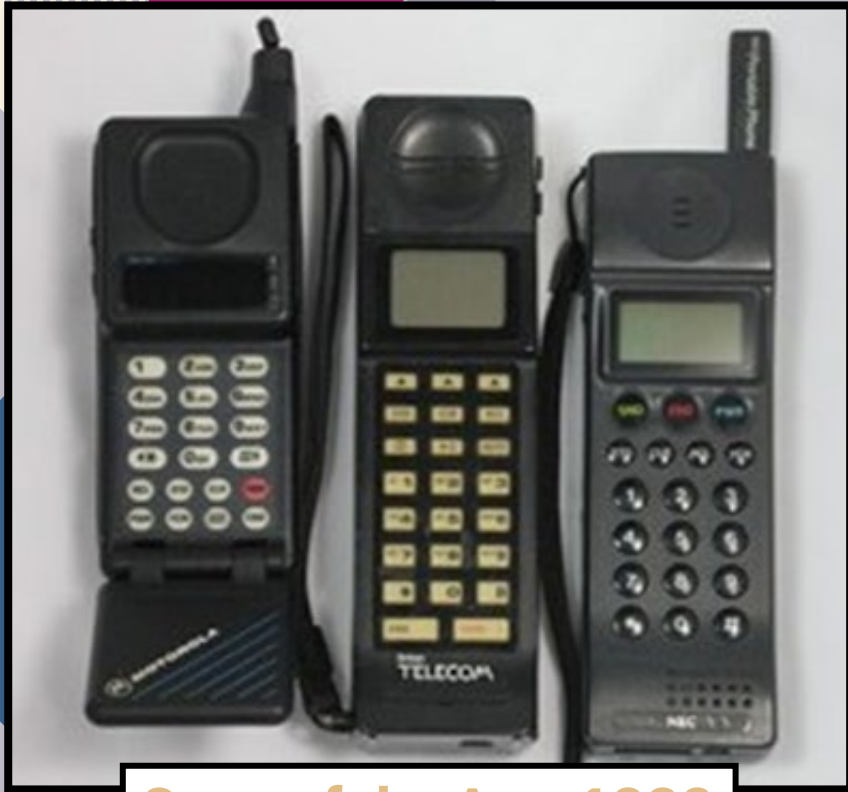
State of the Art - 1998