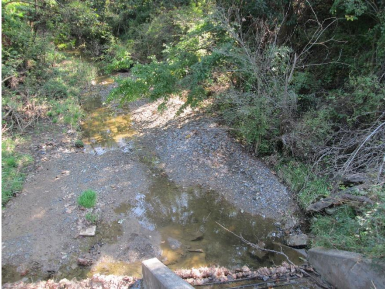
Looking downstream from the structure. Open channel with minimal vegetation near the structure.