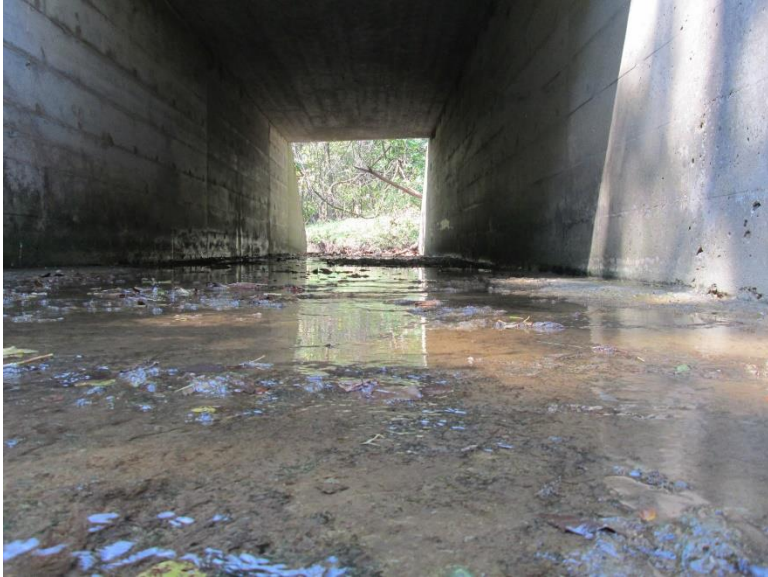
This is the south cell of the RCB. There are no bird nests attached to the walls of the structure. However, there are several mud dauber nests located near the top of the walls throughout the structure.