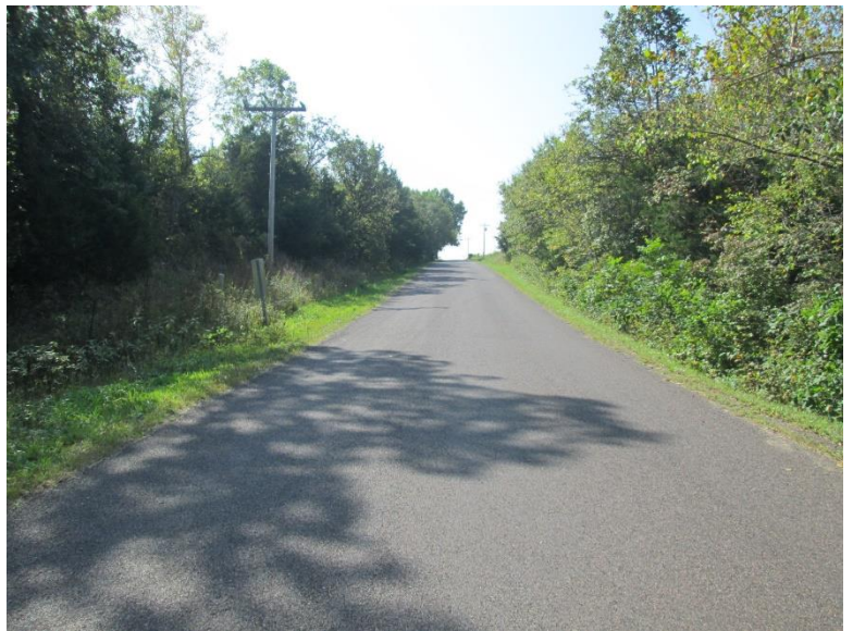
Looking south along Helmig Road from the structure. Note the overhead utilities on the east side of the roadway.