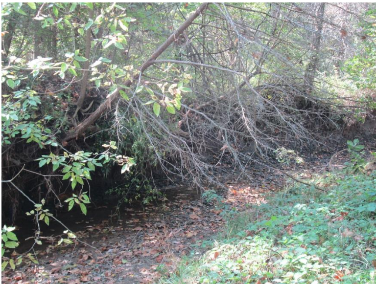
Looking upstream from the structure. The channel is tucked into the bank is directed towards the southerly cell of the RCB. Note the amount of vegetation upstream that will need to be reviewed as part of the environmental clearance.