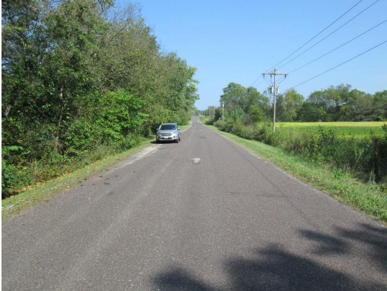
Looking north along Helmig Road from the structure The roadway is chip sealed with minimal grass shoulders.