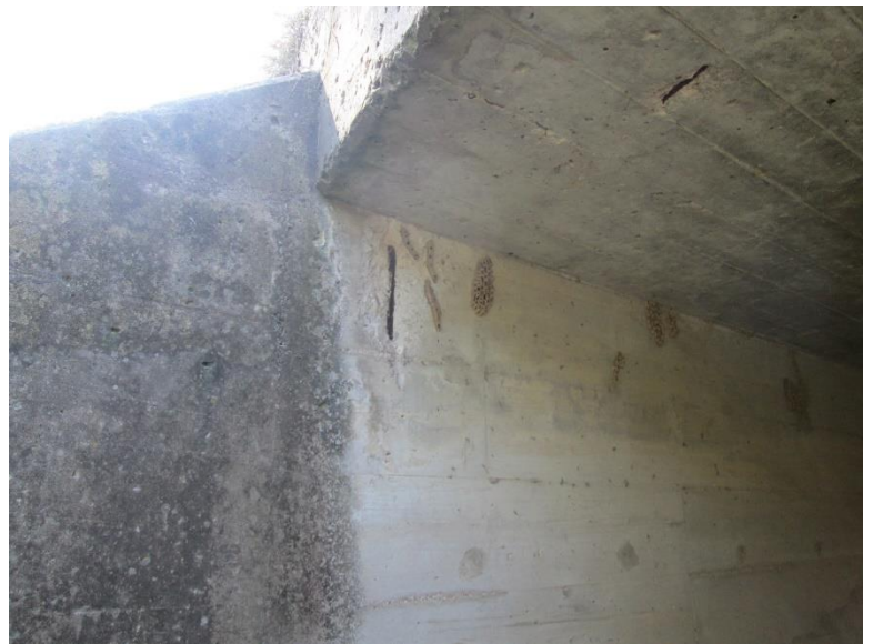
There are several locations within the structure that have exposed reinforcing steel in the ceiling and the walls..