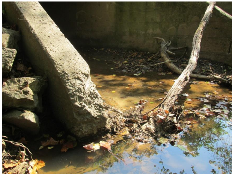
Wingwall damage upstream.