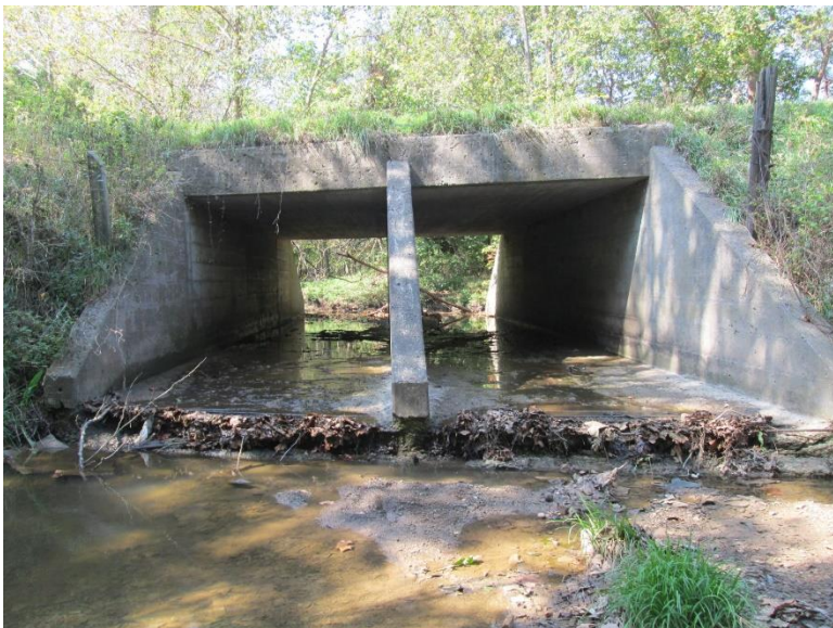
Downstream end of the double cell RCB. The toewall has deteriorated to the point that only the reinforcing steel remains.