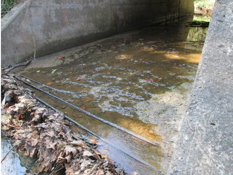
The floor of the culvert is severely damaged. There is exposed reinforcing steel in both cells of the structure.