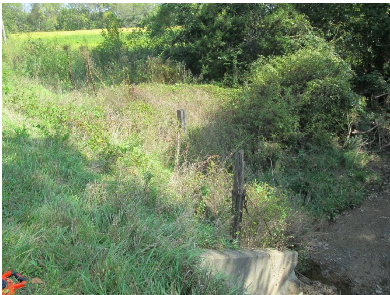
The existing right-of-way is narrower on the east side of the roadway (20-feet) compared to the west side of the roadway (25-feet). Temporary construction and/or permanent drainage easements may be required.