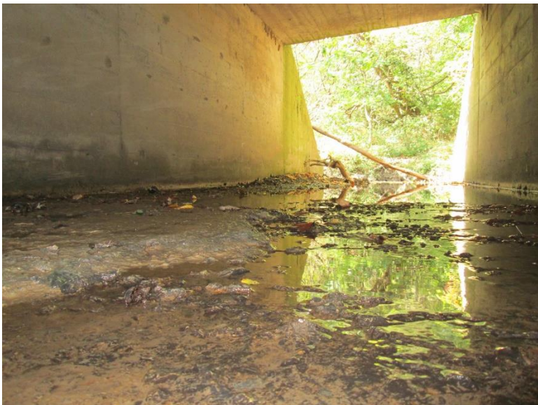
This is the north cell of the RCB. There are no bird nests attached to the walls of the structure. However, there are several mud dauber nests located near the top of the walls throughout the structure.