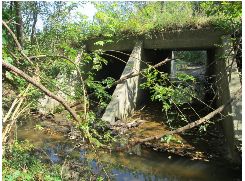
Upstream end of the double cell RCB. The toewall and wingwalls show signs of damage due to higher storm volumes.