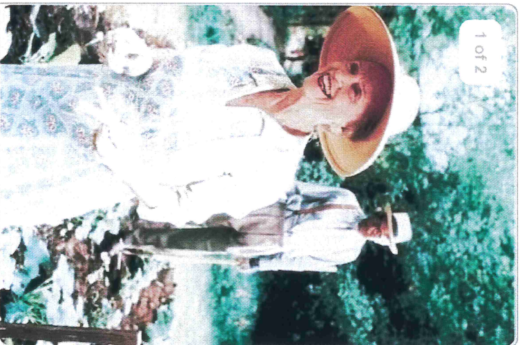
Jessica Tandy and Morgan Freeman in Driving Miss Daisy

Morgan Freeman (born June 1, 1937, Memphis, Tennessee, U.S.) is an American actor whose emotional depth, subtle humour, and versatility make him one of the most-respected performers of his generation. Over a career that includes numerous memorable performances on stage, screen, and television, Freeman is one of the few African American actors who has consistently performed in roles not specifically written for Black actors.