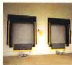
Rolling Service Doors