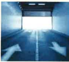
Advanced Rolling Steel Door RapidSlat®