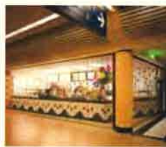
Rolling & Side Folding Security Grilles & Closures