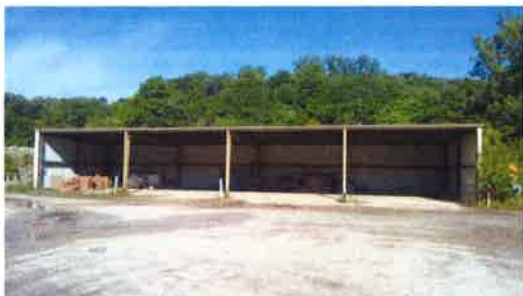
Quarry #2 (as of 5/23/16)