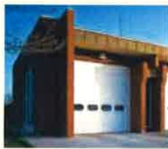
Thermacore® Sectional Doors