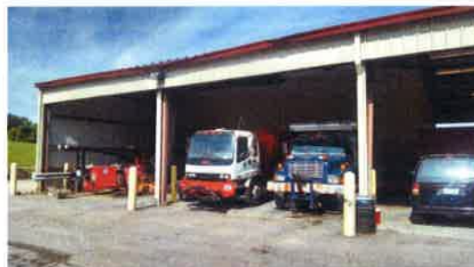
Pole Barn (as of 5/23/16)