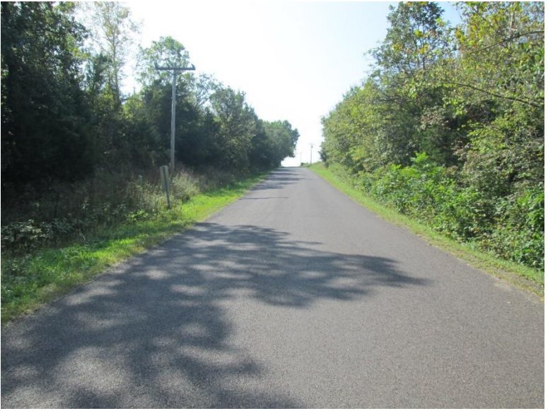
Looking south along Helmig Road from the structure. Note the overhead utilities on the east side of the roadway.