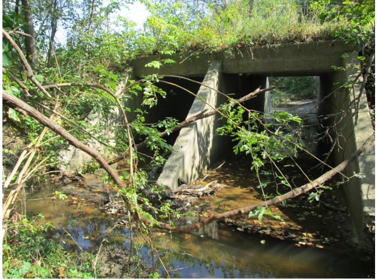
Upstream end of the double cell RCB. The toewall and wingwalls show signs of damage due to higher storm volumes.