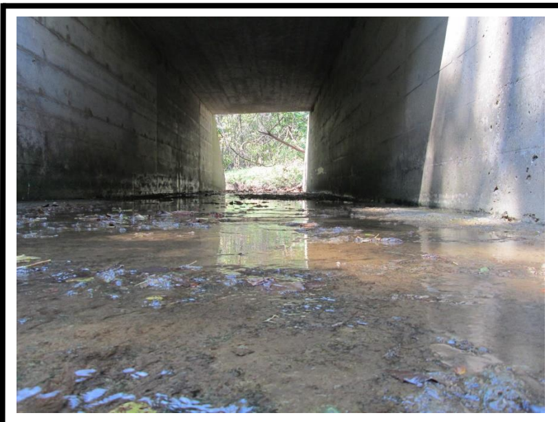
This is the south cell of the RCB. There are no bird nests attached to the walls of the structure. However, there are several mud dauber nests located near the top of the walls throughout the structure.