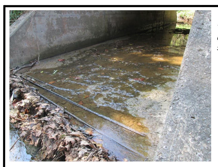
The floor of the culvert is severely damaged. There is exposed reinforcing steel in both cells of the structure.