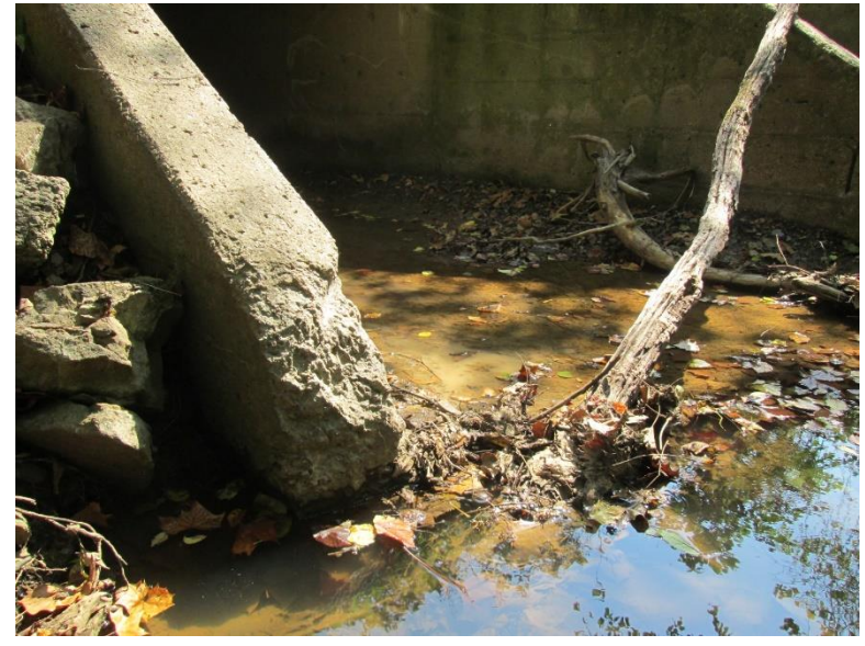
Wingwall damage upstream.