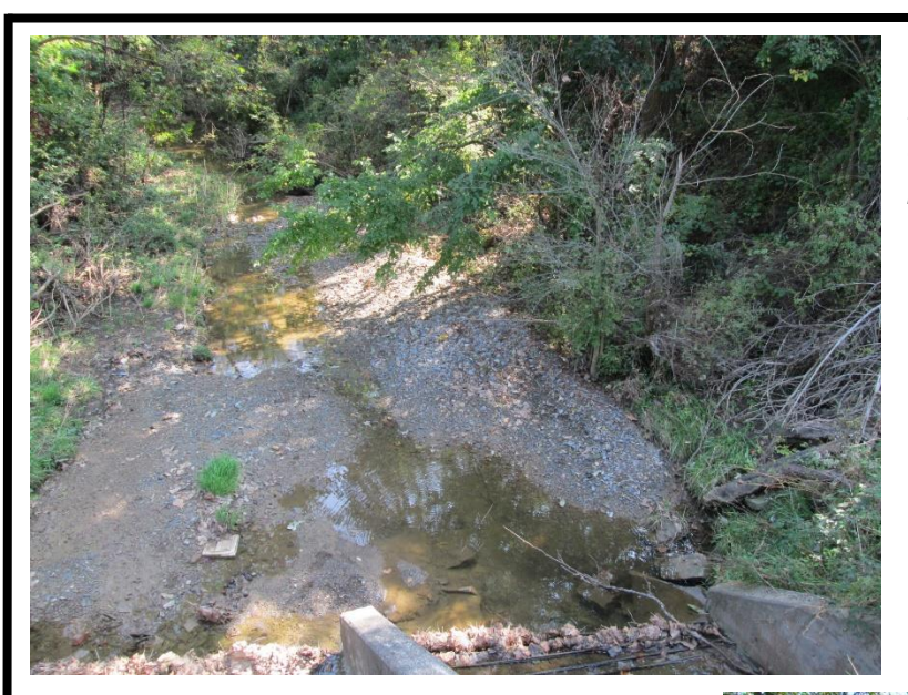
Looking downstream from the structure. Open channel with minimal vegetation near the structure.