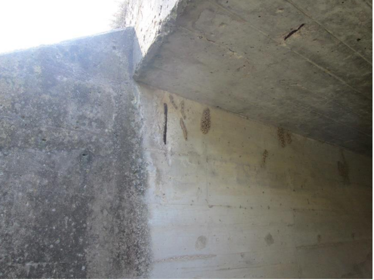
There are several locations within the structure that have exposed reinforcing steel in the ceiling and the walls..