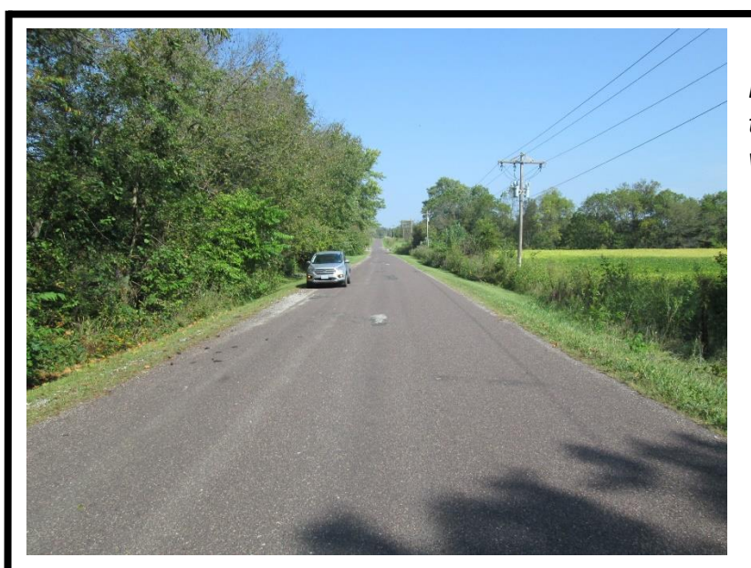
Looking north along Helmig Road from the structure The roadway is chip sealed with minimal grass shoulders.